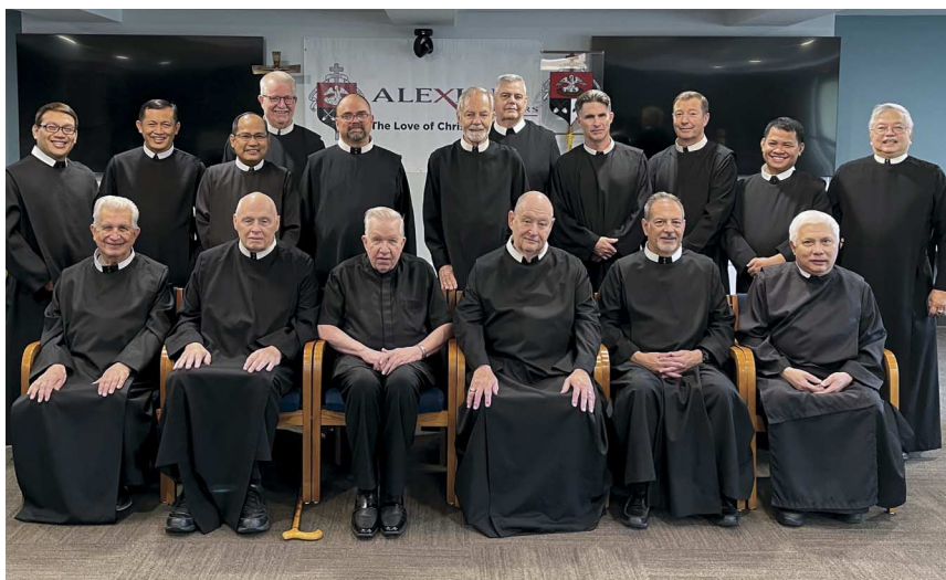
The Alexian Brothers of the Immaculate Conception Province gather for a photo during their Provincial Chapter at the Carmelite Spiritual Center in Darien, Illinois.

The delay left the Brothers with considerable ground to cover, and the 17 Brothers in