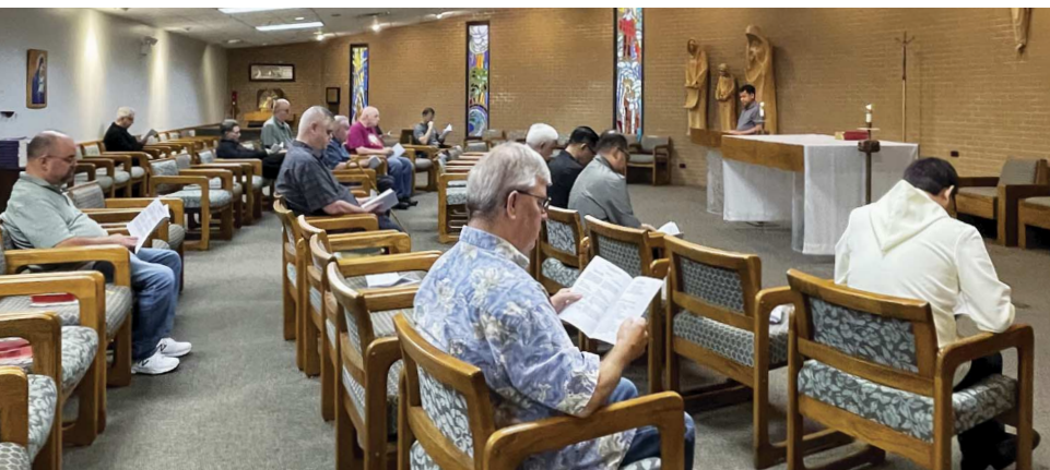
The Alexian Brothers of the Immaculate Conception Province pray together during their Provincial Chapter.

allowing Brothers to participate in short mission trips sponsored by other organizations to places such as Nigeria, Thailand, Guatemala, Mexico and the Navajo Nation in Arizona. The Brothers also approved a proposal to make themselves available to help organizations providing aid to communities reeling from natural disasters such as tornadoes, hurricanes and floods. Brothers